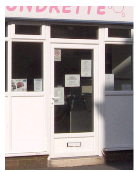
Full glazed doors can cause problems for the partially sighted.

shopfront. Property numbers should be displayed on the door. 11.3 Entrance doors should be of a minimum width of 900mm with a clear opening. Any handles