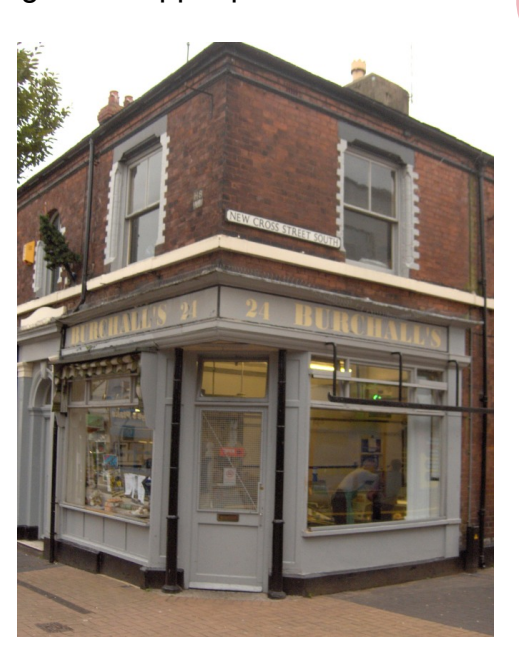
A Victorian shopfront.