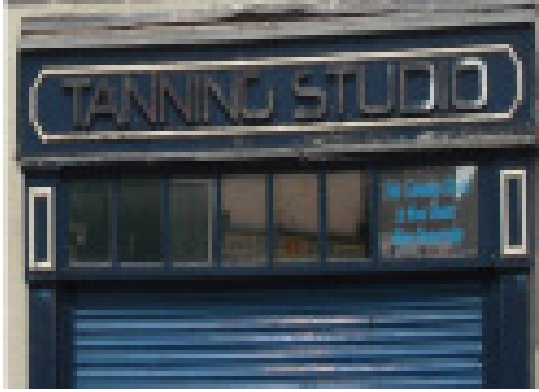
Concealed shutter box and runner.