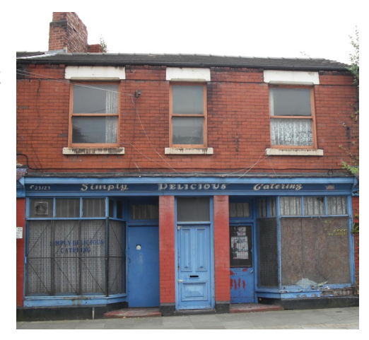
A Nineteenth Century shopfront.

5.5 This period saw the classical style that developed during the last century becoming more pronounced. Projecting bays that were previously the norm were now outlawed in most places to avoid obstructing the pavement. The recessed doorway became a standard feature particularly from the late Eighteenth Century onwards. This not only gave shelter to customers but provided a greater window display area. Advances in glass production meant that cylinder glass became available, allowing larger panes, that were divided up by vertical glazing bars and moulding on the outside.