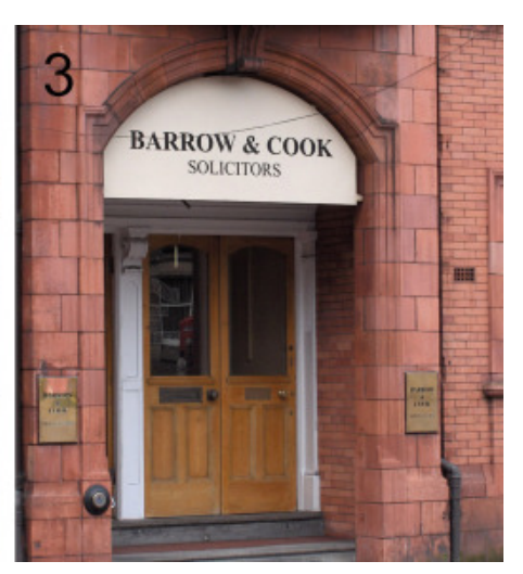
Inappropriate and excessive fascias should be avoided (1). They should be of an appropriate material and typeface (2) and fit according to the character and features of the building (3).