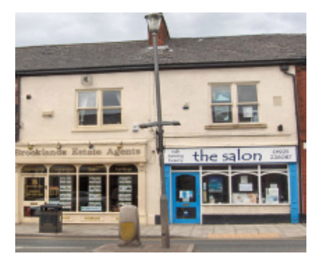
Shopfronts should be in proportion to the building.

8.6 The type of materials used in the construction of the shopfront and its finish are important in integrating the shopfront within the building's façade and the surrounding area. The following are important considerations: