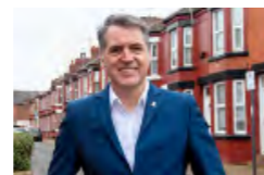
Steve Rotheram Mayor of the Liverpool City Region

Projects like Mersey Tidal Power could eventually generate enough renewable electricity to power hundreds of thousands of homes, helping to build long-term energy security while supporting jobs and growth here in the region.