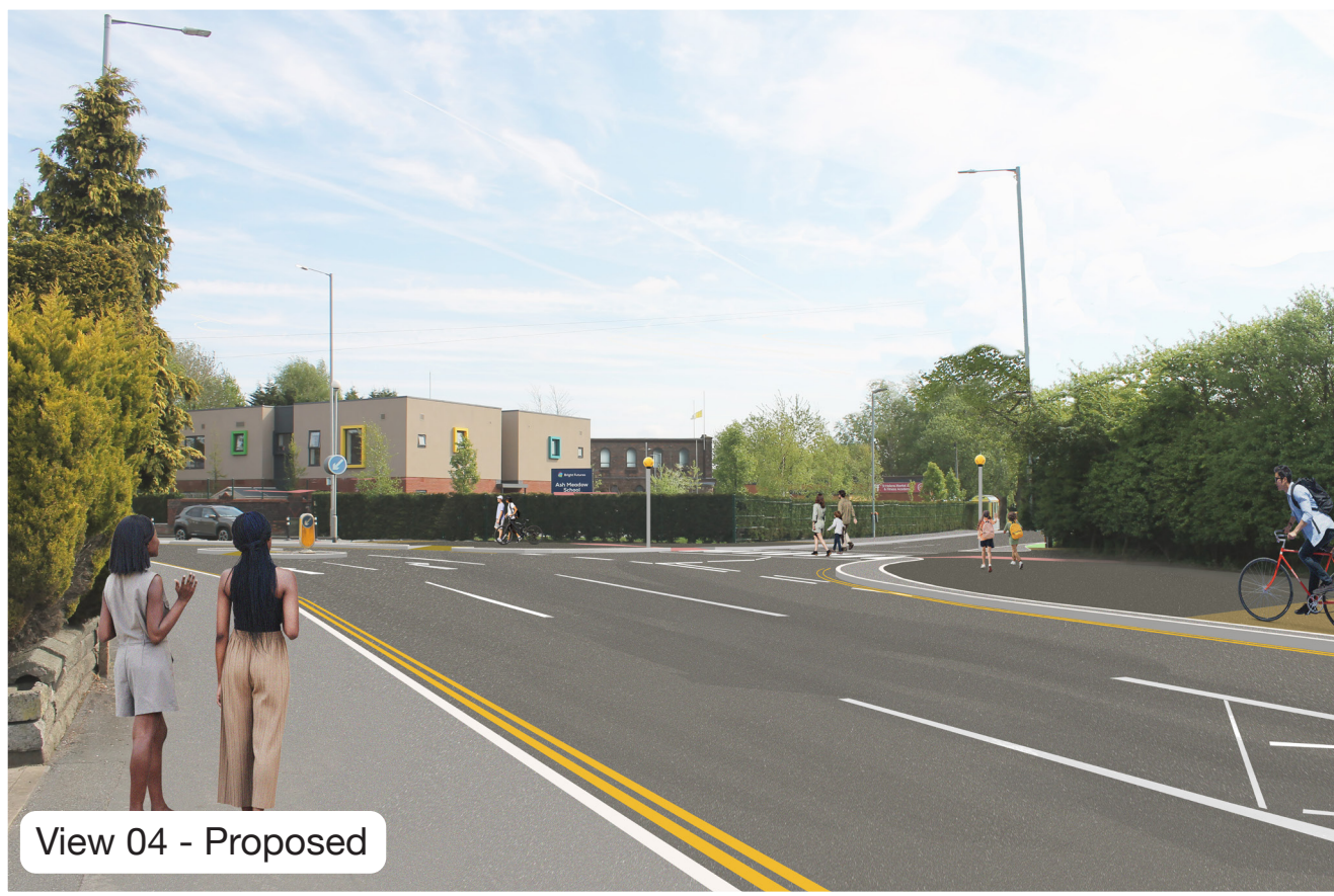
View 04 - Proposed